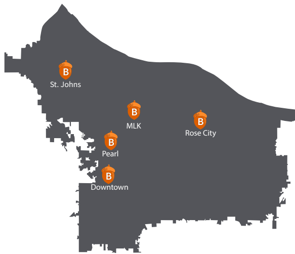
City of Portland, Municipal Boundary

Total loan dollar commitments in millions to businesses and nonprofits through March 31, 2020